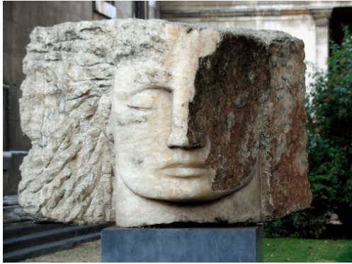
Archangel Michael , Emily Young, 2004